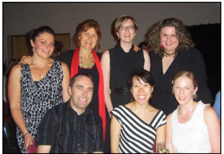
ECLC Staff enjoying their time at the National Conference Dinner.

The Conference gave staff the opportunity to explore new ideas and approaches, develop skills, share experiences and even have a bit of a dance (at the official Conference dinner; sadly there were no dancing workshops)! With all that sharing, networking and inspiration, stay tuned for some new ideas at ECLC!