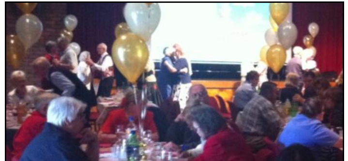
The Launch of Older & Wiser was held at the Mooroolbark Community Centre as part of Seniors Week in October.

The Mayor stated, "We're confident this free guide will be a great asset to many in our community. It's an excellent book and I congratulate them highly."